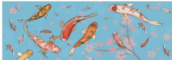
Location: 13th Street & Warren Ave.