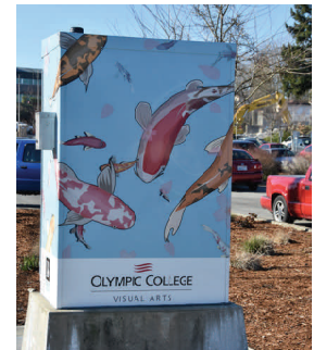
Executed art on cabinet