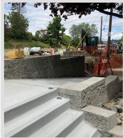
Construction of Lower Washington Ave Sidewalk to Roundabout Sidewalk