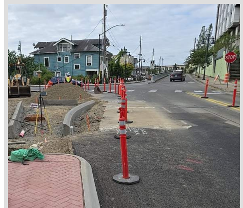
Washington Ave Looking South as Phased Roundabout Construction Begins (June 2024)

Phase 3 roundabout construction is anticipated to be underway in early August or sooner and will include additional short-term traffic impacts. Once the roundabout construction is complete, a final layer of asphalt pavement will be placed along the entire project and permanent pavement markings will be installed. Miscellaneous improvements not significantly impacting use of the roadway (landscaping, lighting, etc.) will continue to occur project-wide as other work is occurring.