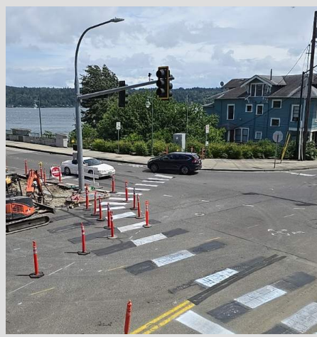
Temporary Pedestrian Crosswalk and all-way stop