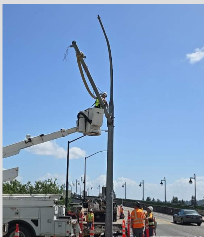
Traffic Signal Removal