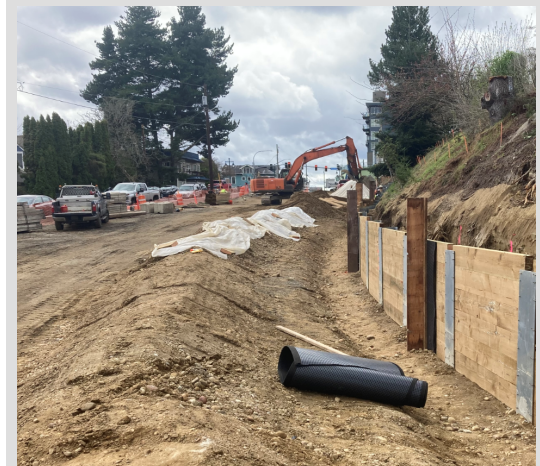
Construction underway for new decorative retaining wall along the west sidewalk (Washington Ave)