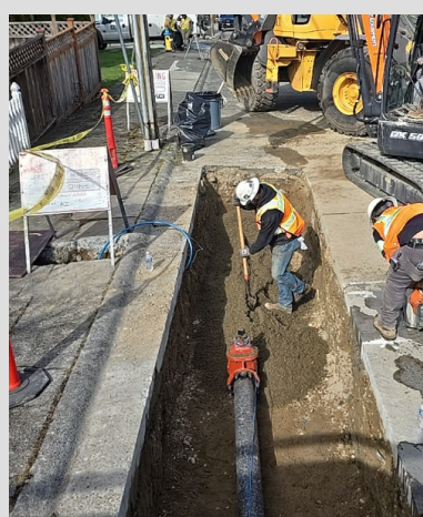
Installation of new water mains across 11th St (Highland & Pleasant)