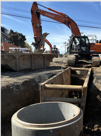
Continued installation of improved underground stormwater systems