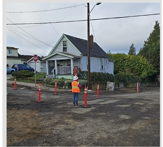
Ongoing Temporary Closure of 11th St and Washington Ave (Pacific Ave to North of the Manette Bridge) Local Access Maintained

We thank you for your continued patience and support!