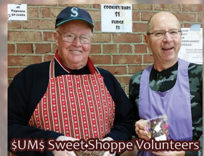
$UM$ Sweet Shoppe Volunteers

The "Active Us" is THE place to get your information for the Bremerton Senior Center.