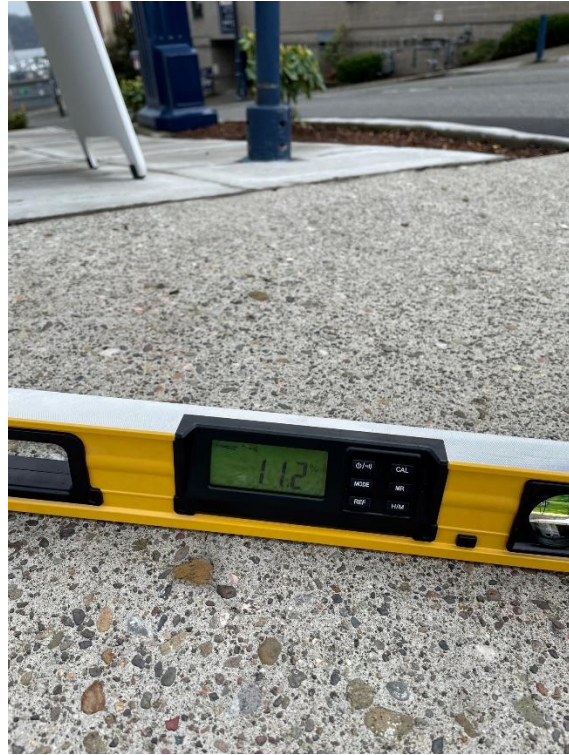
Sidewalk leading into ramp, 2 nd Cul-de-sac