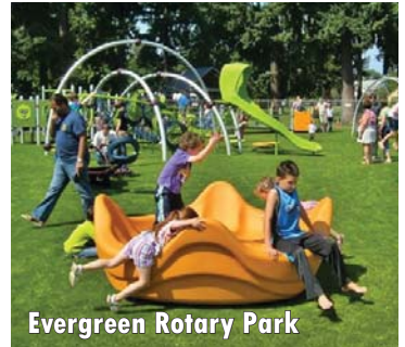
Evergreen Rotary Park