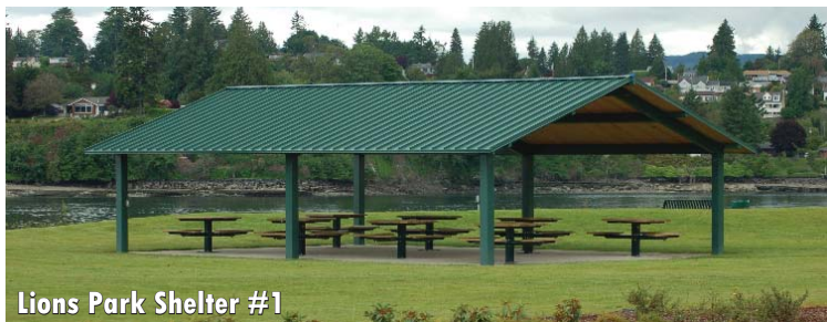
Lions Park Shelter #1

Park & Shelter Reservations: A permit is required to reserve an athletic field, shelter, a park or portion of a park for larger group gatherings. Use permits prevent conflicts, make necessary preparations, prepare facilities and avoid over use. Reservation forms are available at www.ci.bremerton.wa.us or at the Bremerton Parks and Recreation Office located at 680 Lebo Blvd., Bremerton, WA 98310. All reservations are first come, first served. Questions? Phone (360) 473-5305 or fax (360) 473-5882.