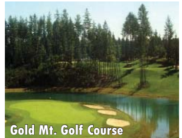
Gold Mt. Golf Course