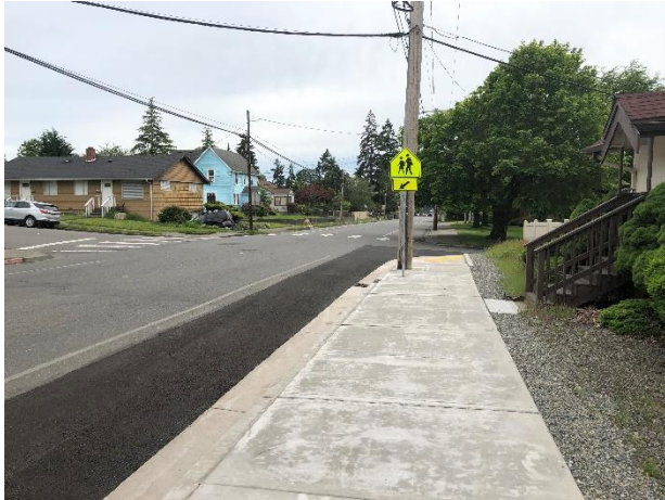
Perry Ave at Holman Rd looking south