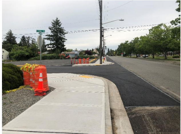
Perry Ave at 24 th St looking north