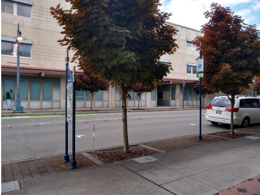
Burwell Street and Pacific Avenue. City Complete Streets project installed dedicated ADA Parking stall on south side of roadway. (Above)