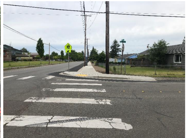
Perry Ave at Magnuson Way looking south