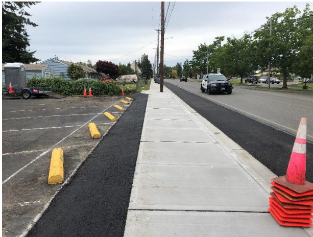
Perry Ave at 24 th St looking north