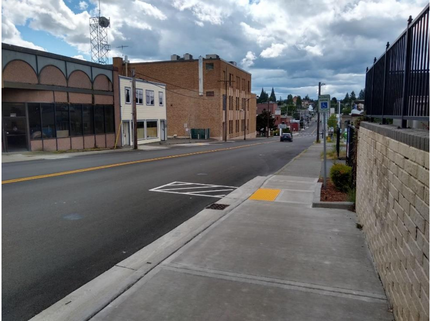
6 th Street between Pacific Avenue and Park Avenue. City Capital project installed two dedicated ADA parking stalls with accessible ramps. (Above)